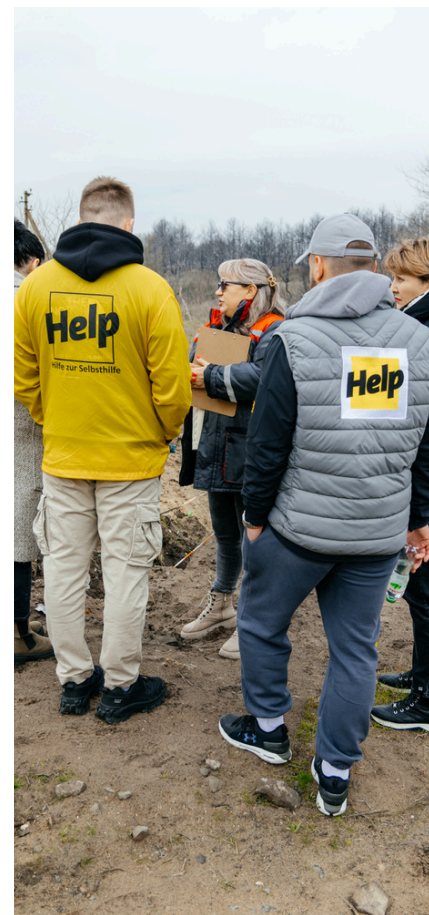
Transfer of materials for the repair of the water supply system. Mykolaiv region, March 2024