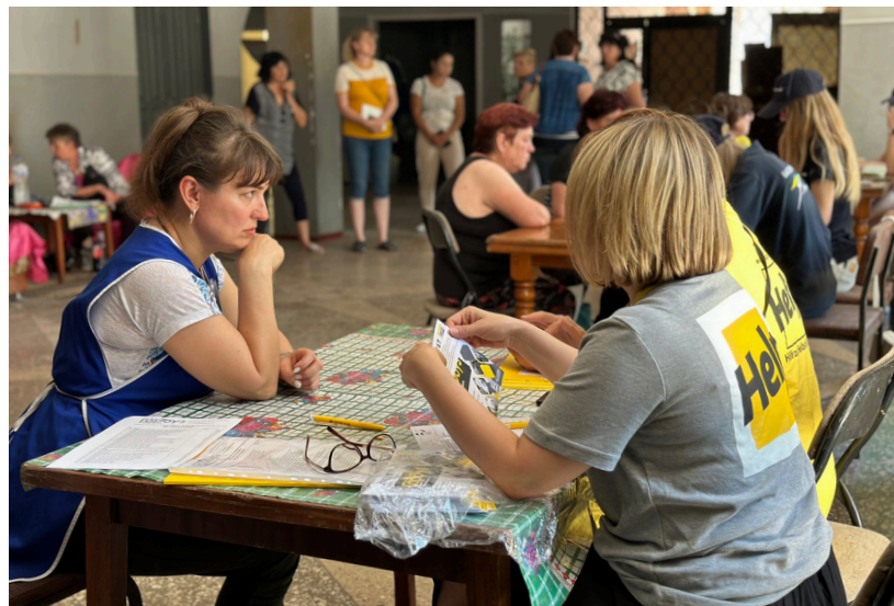
Issuance of certificates for feed additives to domestic animals owners, Kharkiv region, June 2024

This helps to strengthen the forces of civil society in Ukraine.