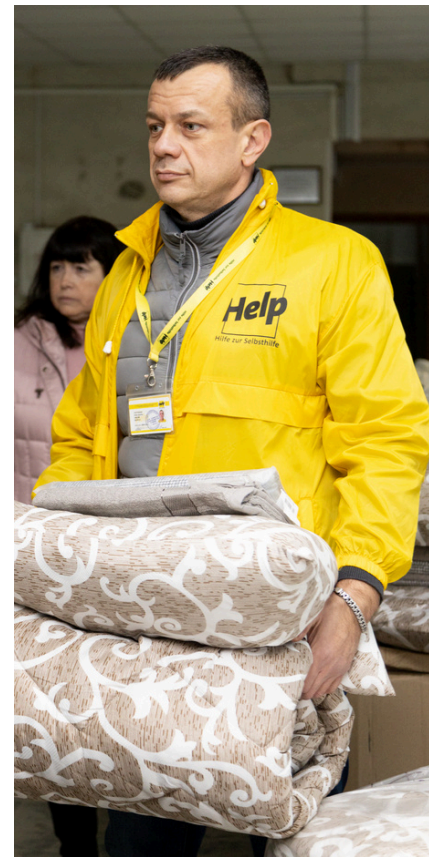
Distribution of bedding sets. Kharkiv region, November 2023

Together with our partners, we support survivors of violence by providing them with cash for rent and psychosocial support. The war-affected population and internally displaced people also receive psychological assistance, psychosocial sets and materials for children's development.